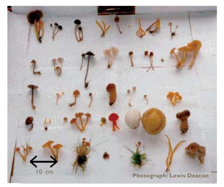
Basidiomes collected at the 2000 sampling showing the complete range of species morphology

Compared with the species kindly collected in autumn 1999 by Dr Sarah Buckland, there were greater numbers of species and individuals recorded in 2000. There were also differences in the five most common species recorded between the two collections.