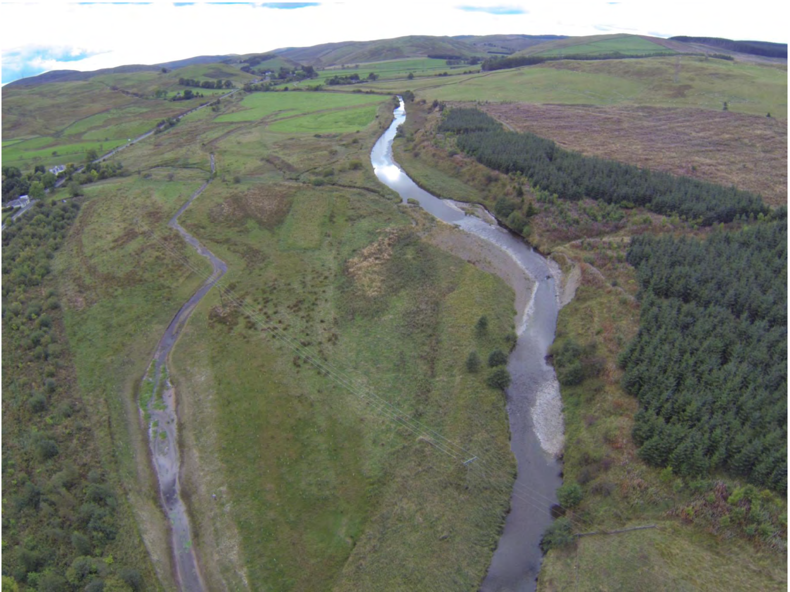
Bowanhill. Sept 2014. New channel route, vegetation regrowth