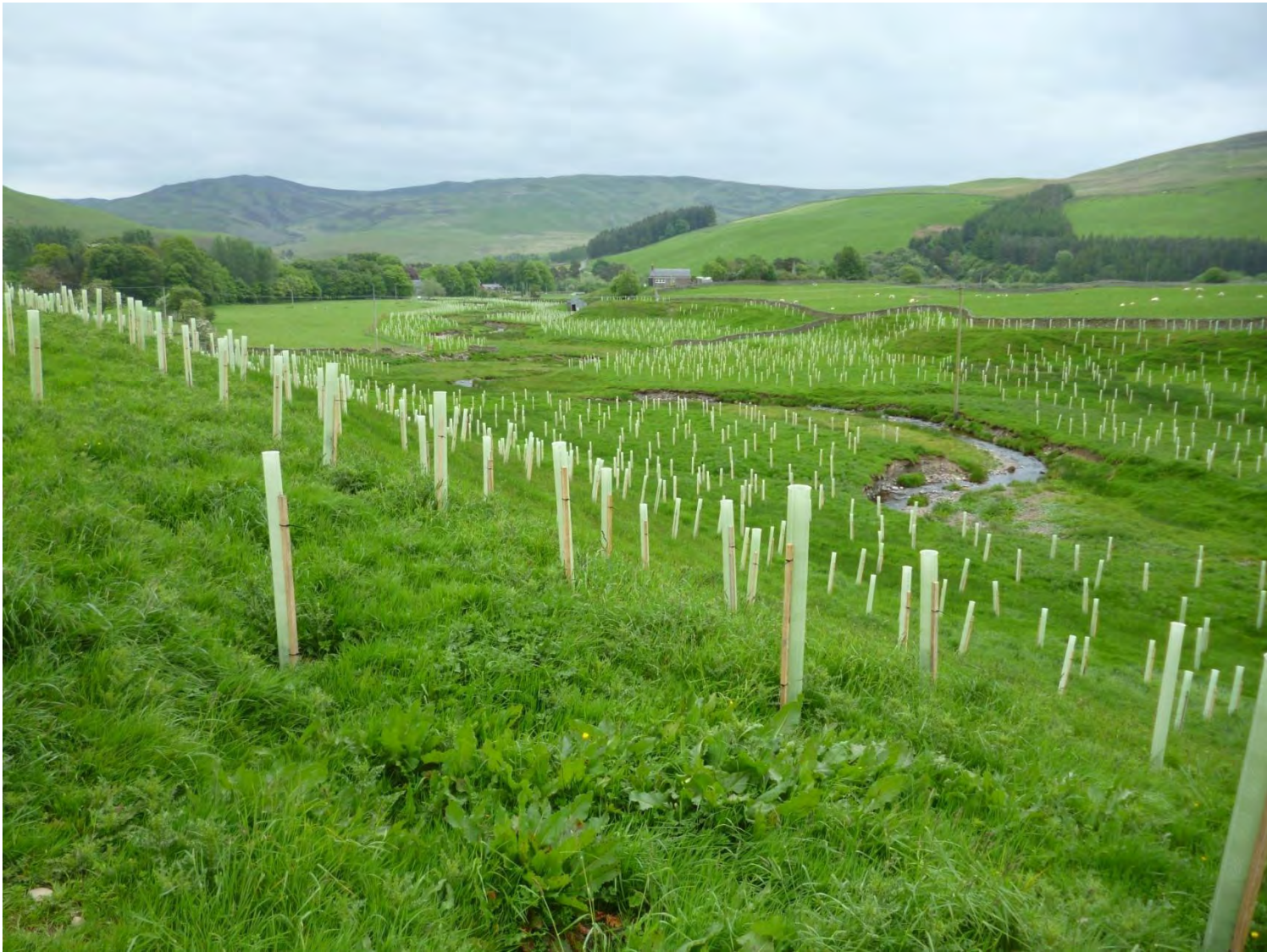
Whitehope Burn 7ha native riparian woodland planting. May 2014