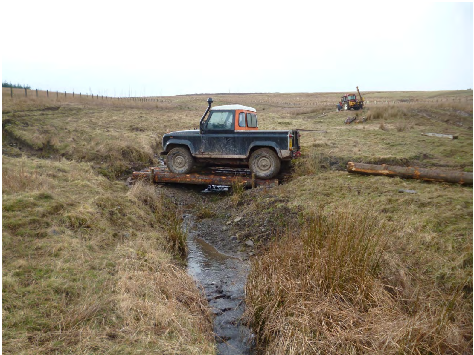
Ruddenleys - March 2014