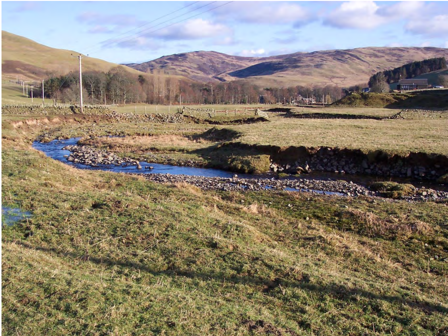
Whitehope Burn 7ha native riparian woodland planting. Feb 2012