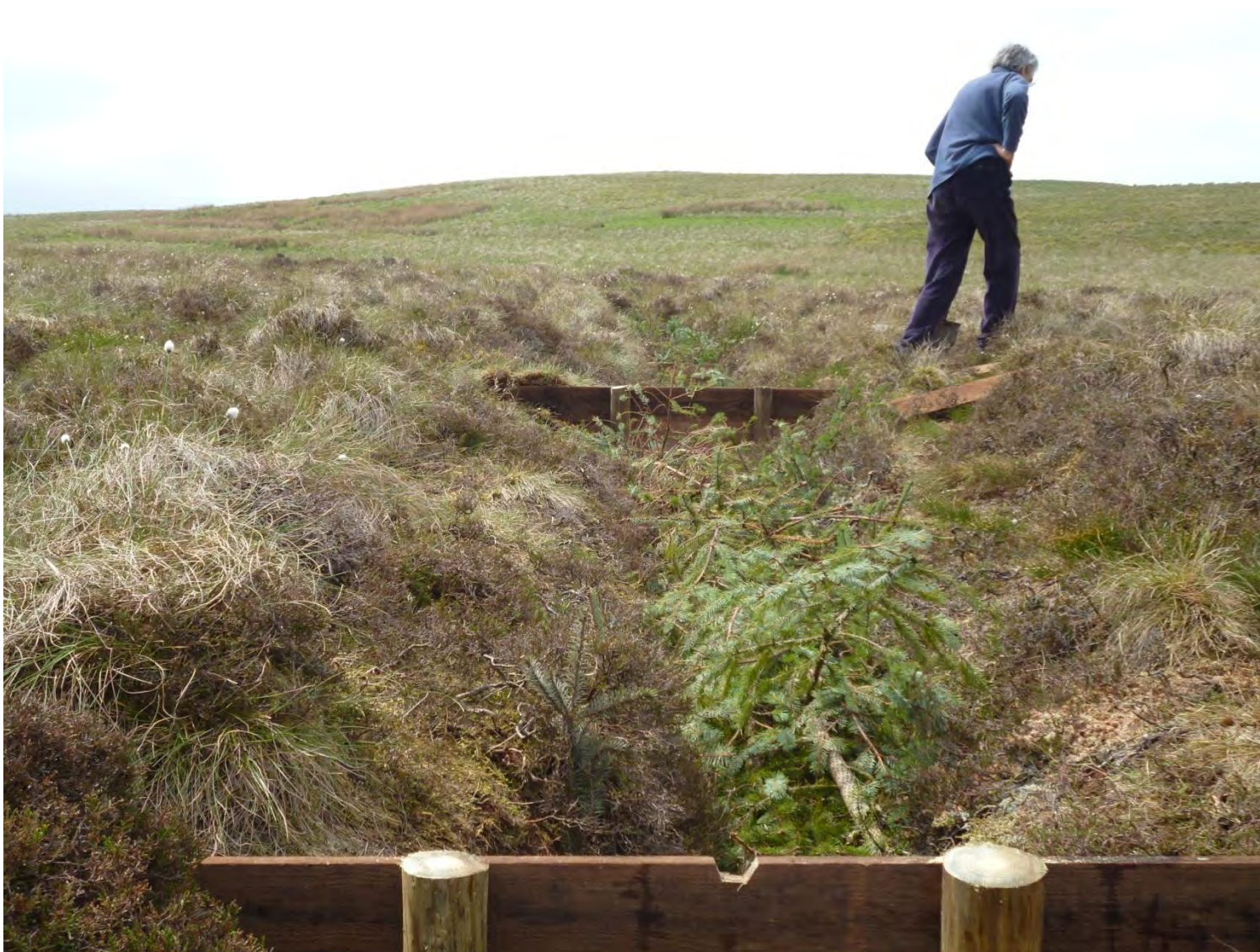
Mountbenger, Ettrick, Blocking eroding drains on deep peat. SBC Glenkerie funded activity.