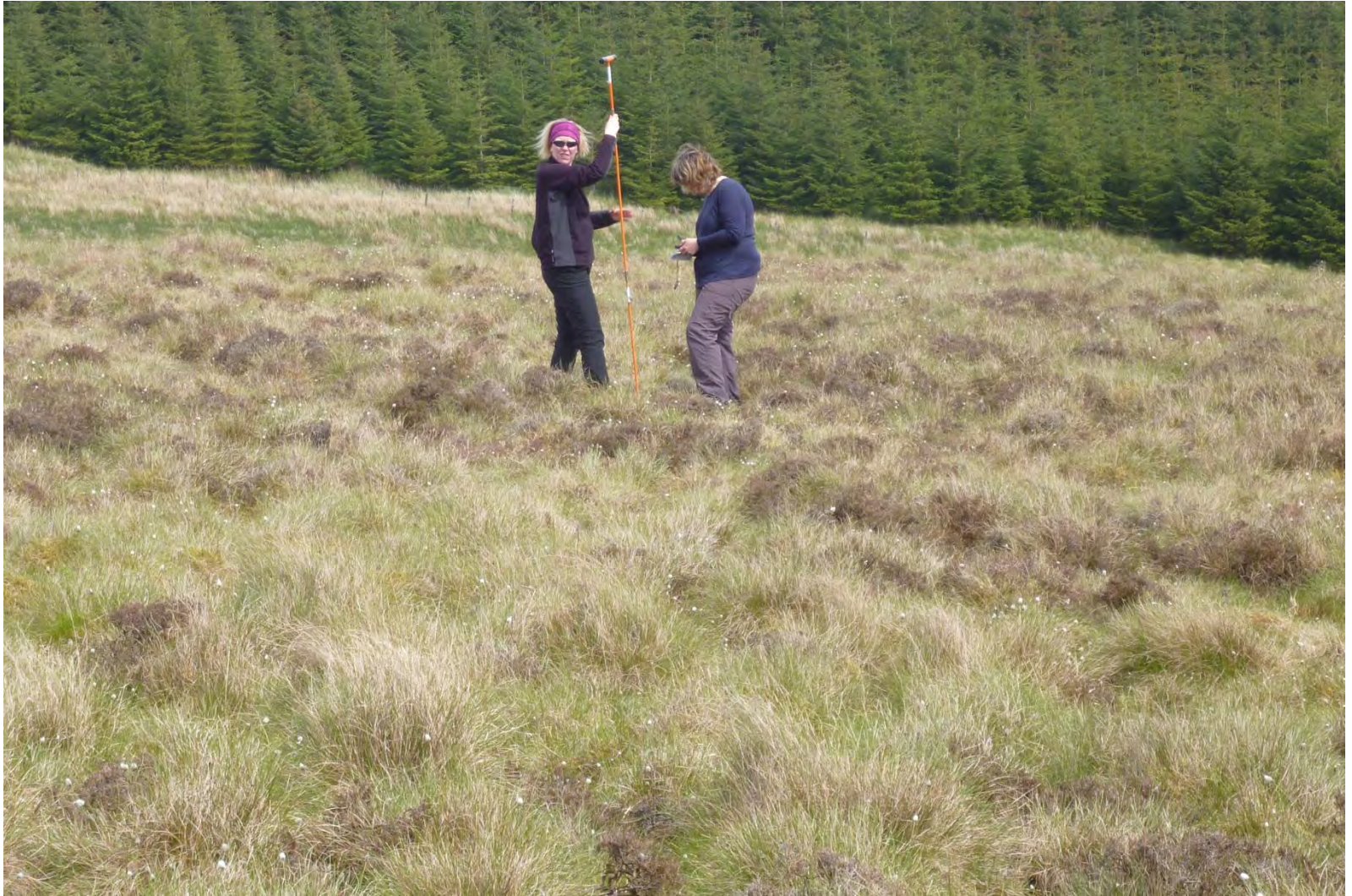
Mountbenger, Ettrick, Blocking eroding drains on deep peat. Measuring peat depth.