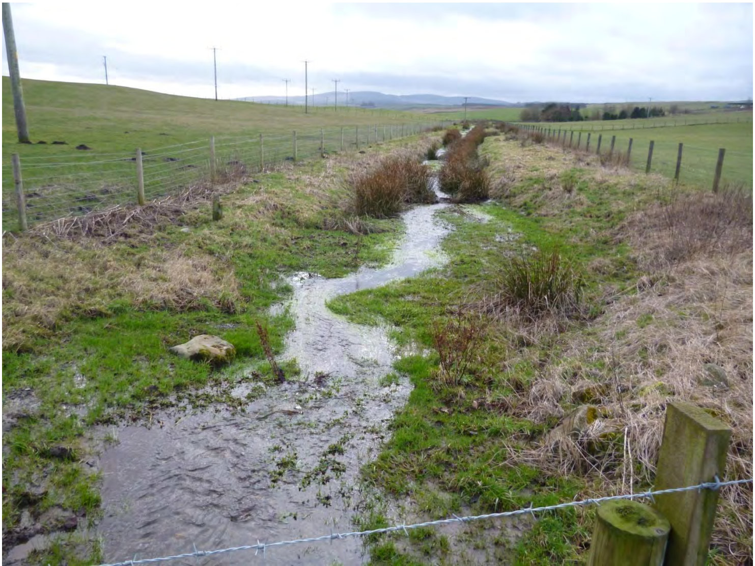
Craigburn re-profiling upstream reach. About to start