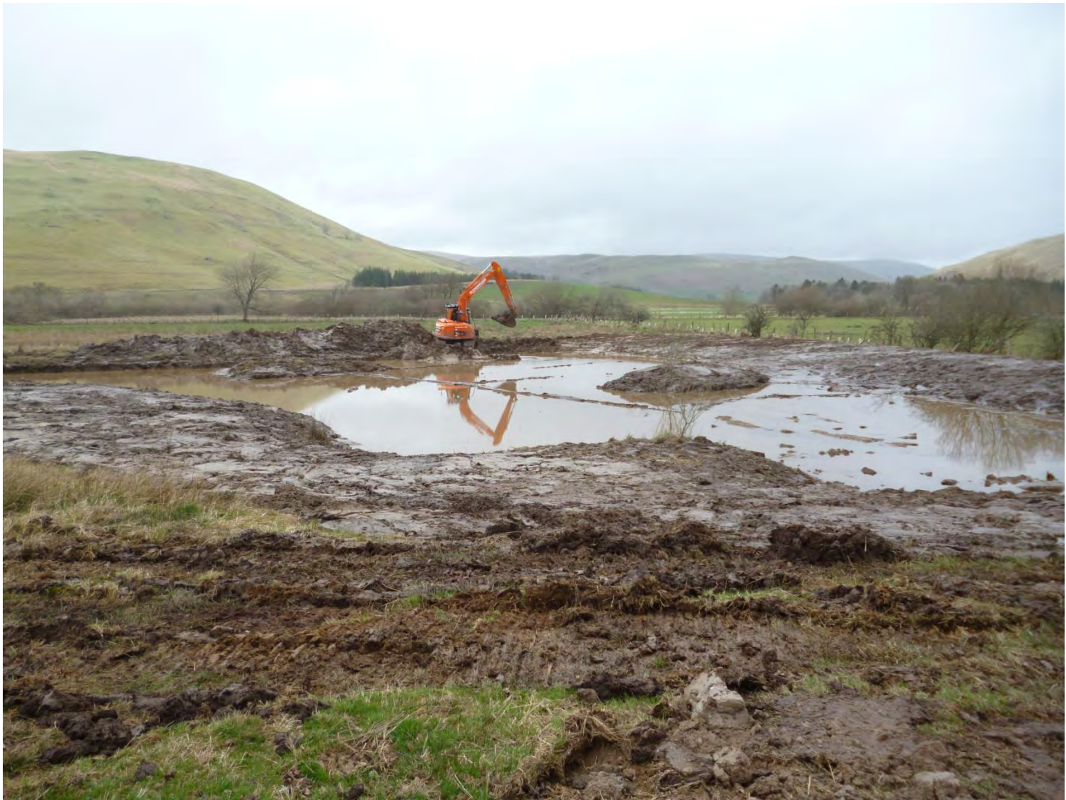
Annelshope, Ettrick, Flood plain flood water storage pond. 10.4.14