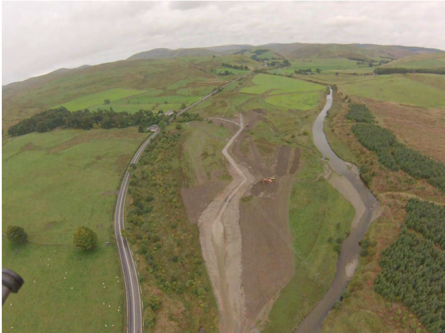
Bowanhill. August 2013. New channel route,