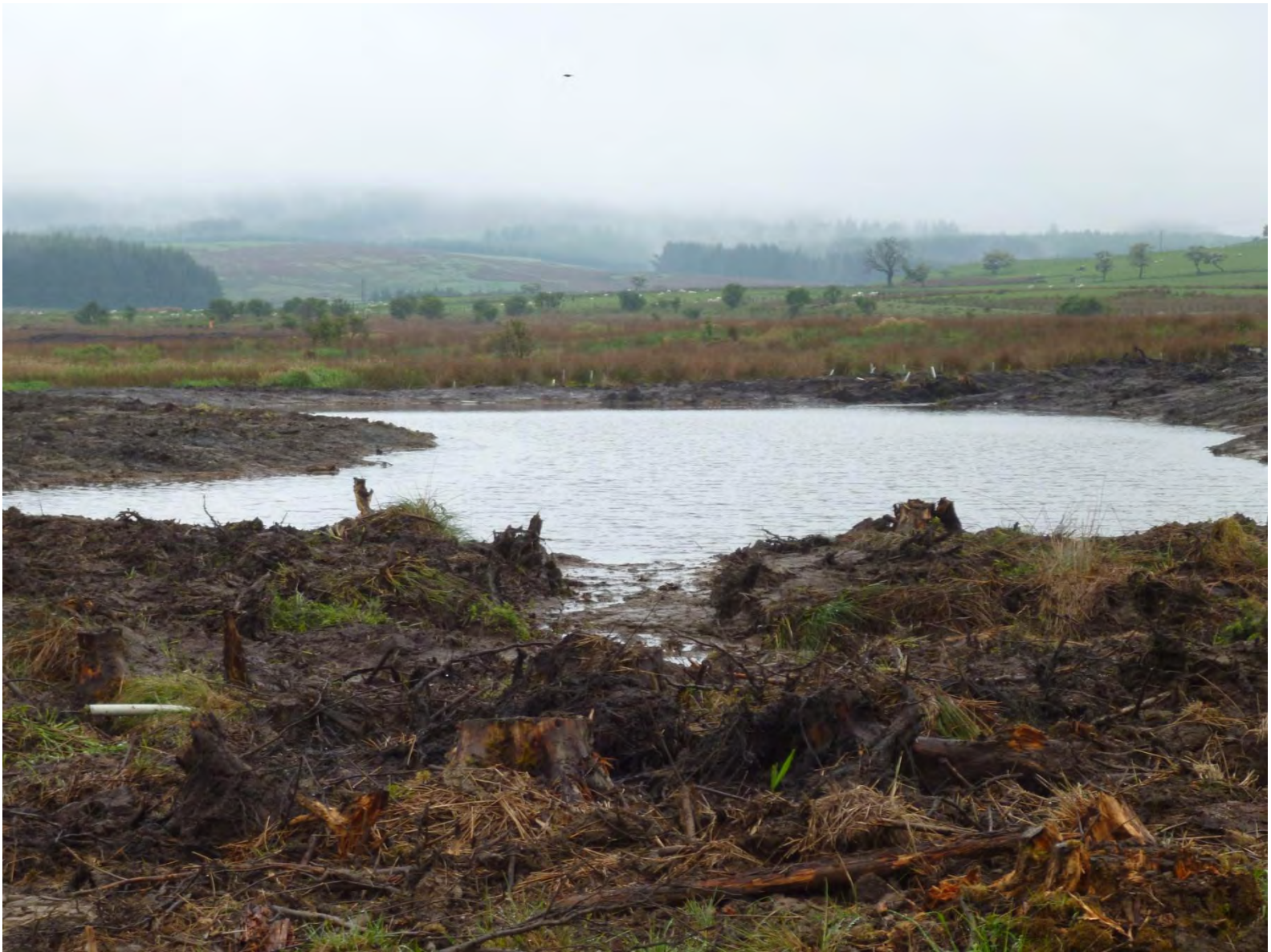
North Cloich - Flood storage pond in action— 5.6.2014