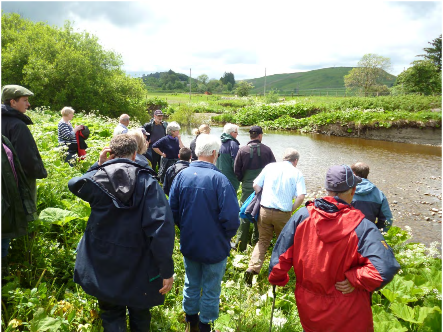
Bowanhill. Tweed Forum and SRUC Farm visit to see new channel and floodplain woodland