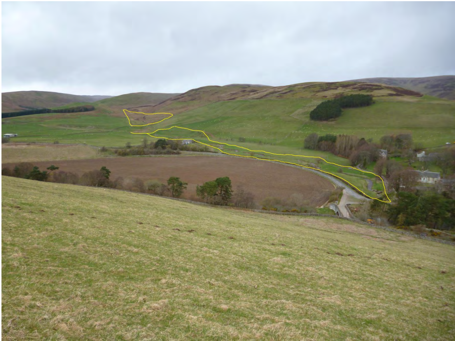
Whitehope Burn 7ha native riparian woodland planting