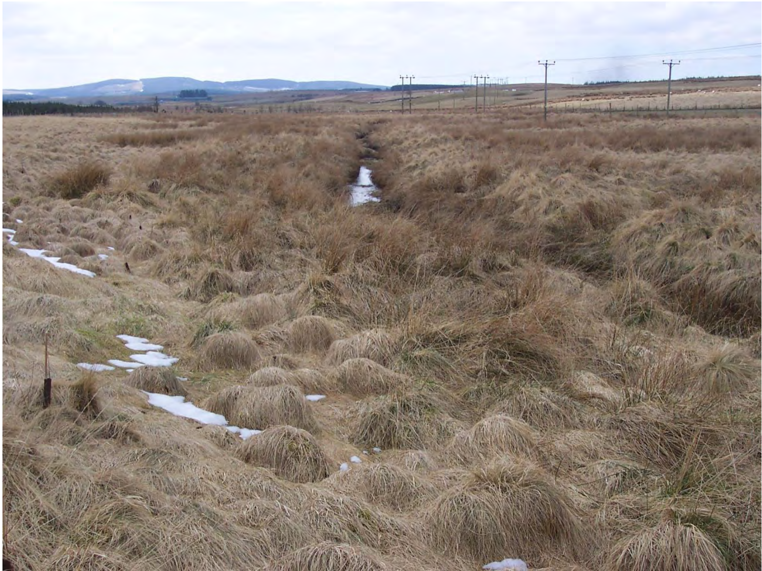
Craigburn 800m reach to be restored using 34 log jams. About to start