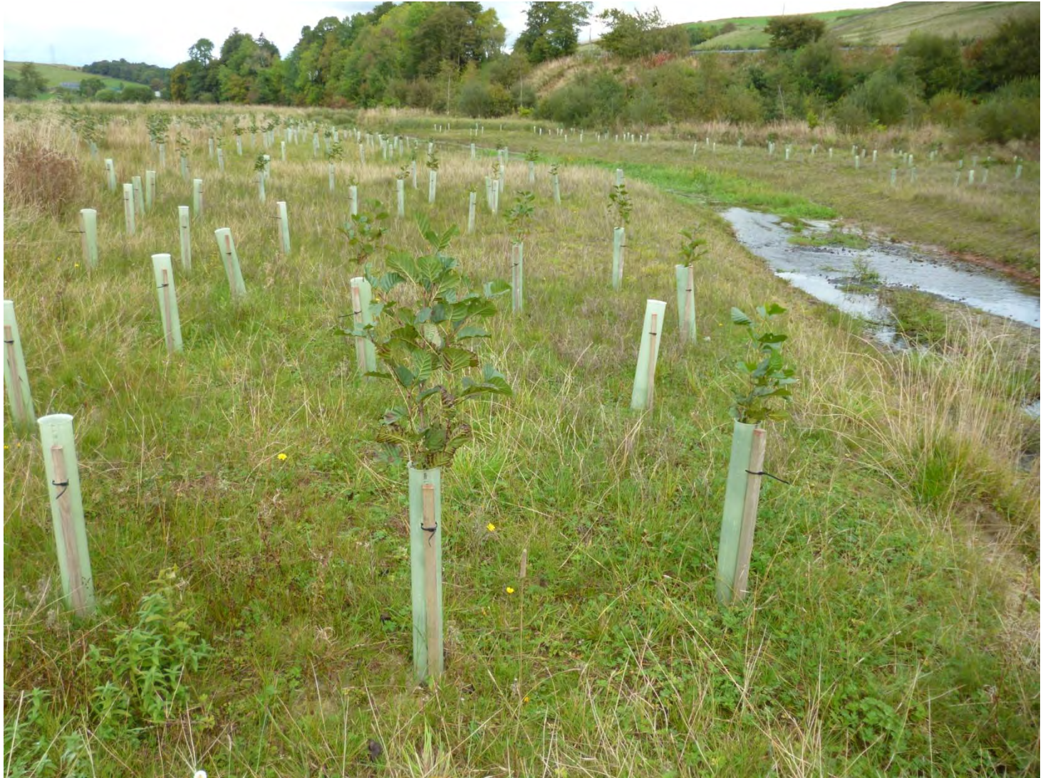
Bowanhill. Sept 2014. New channel , vegetation regrowth. SRDP wet woodland