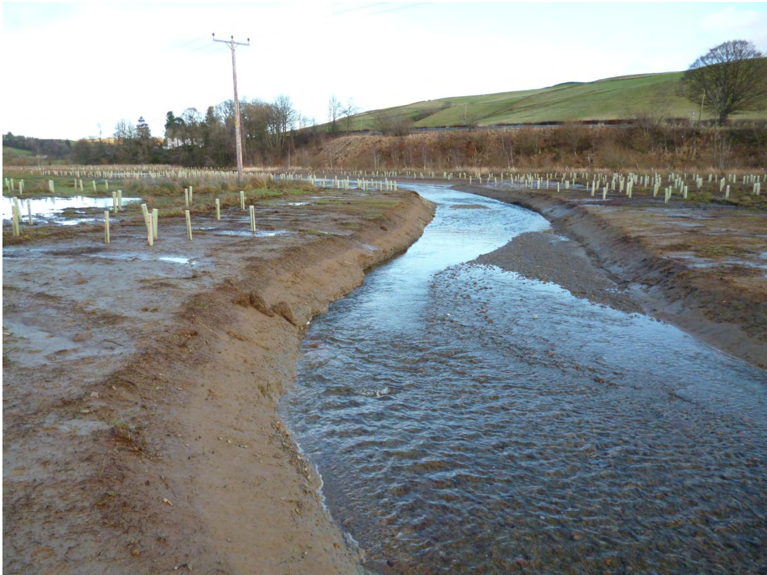
Bowanhill. Jan 2014. New channel developments