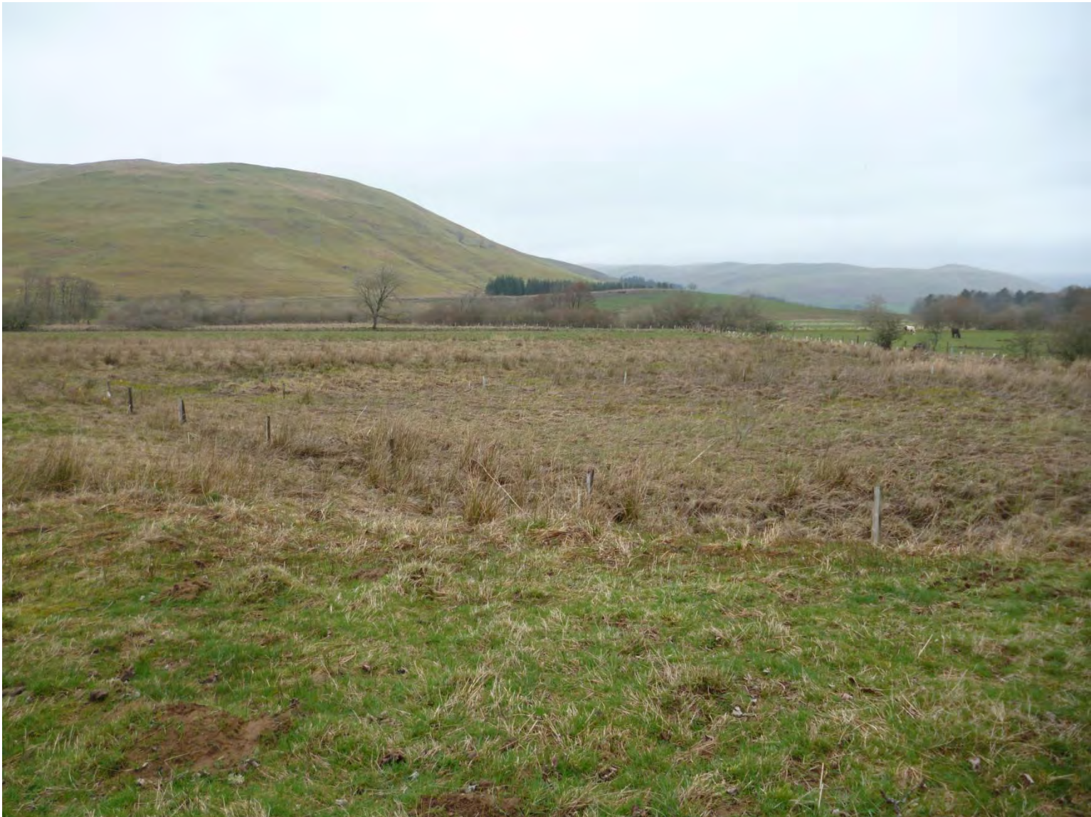
Annelshope, Ettrick, Flood plain flood water storage pond. 4.4.14