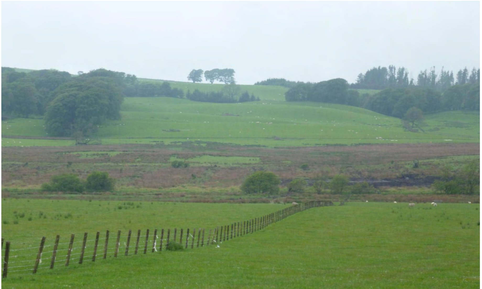
North Cloich and Wester Deans - March 2014