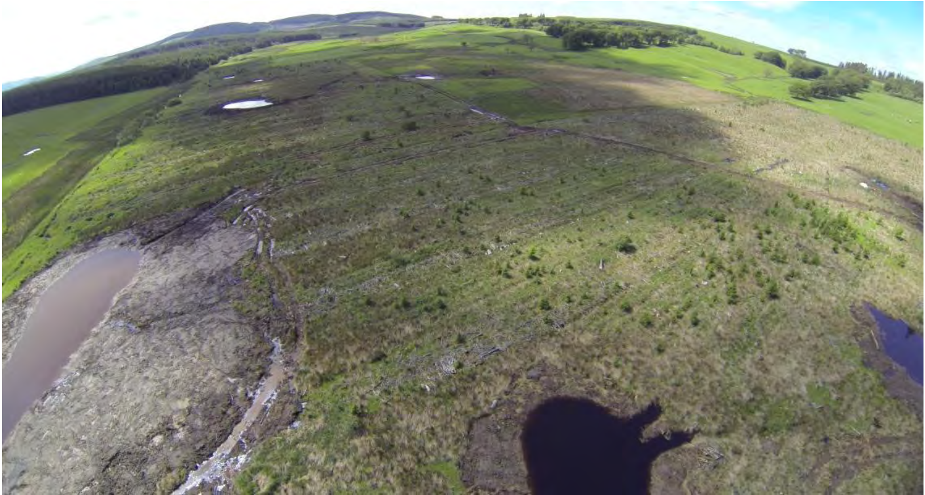
North Cloich - March 2014