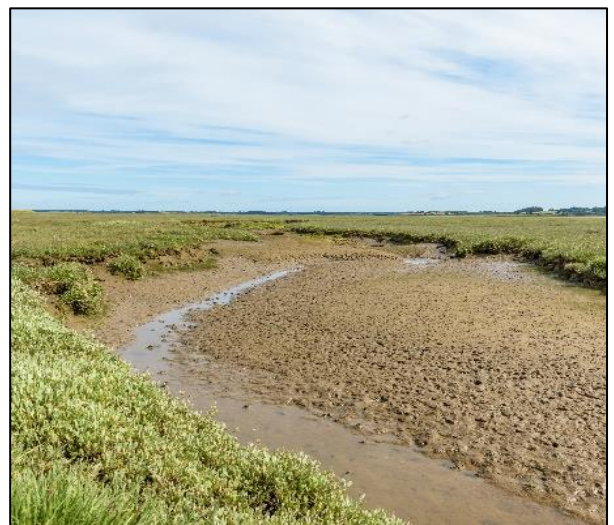
An example of a healthy saltmarsh in Caernarfon wildlife and preventing floods and pollution.

Researchers at the UK Centre for Ecology & Hydrology (UKCEH) are quantifying the amount of carbon that these habitats can absorb from the atmosphere and store, as well as studying their role in supporting