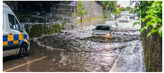
Surface water flooding.