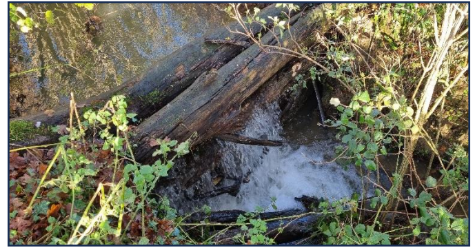
A leaky dam at a NFM project involving UKCEH in West Oxfordshire.

Farming practices to improve water storage and capacity, slow the speed of