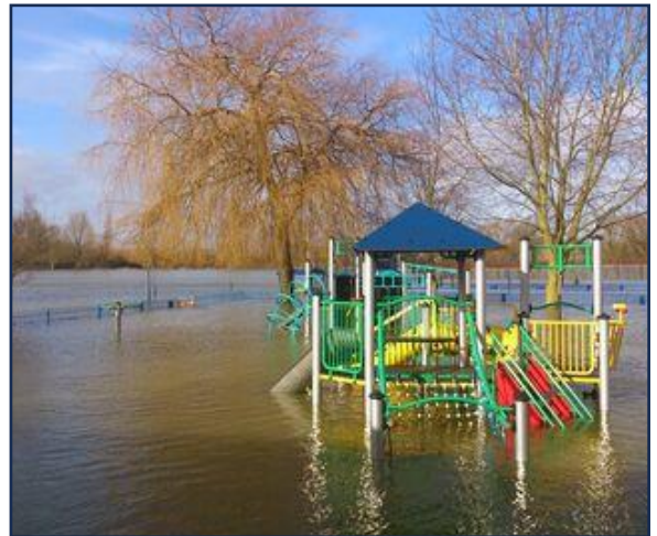
Flooding in Oxford in January 2014.

The Met Office says extended periods of extreme rainfall are seven times more likely