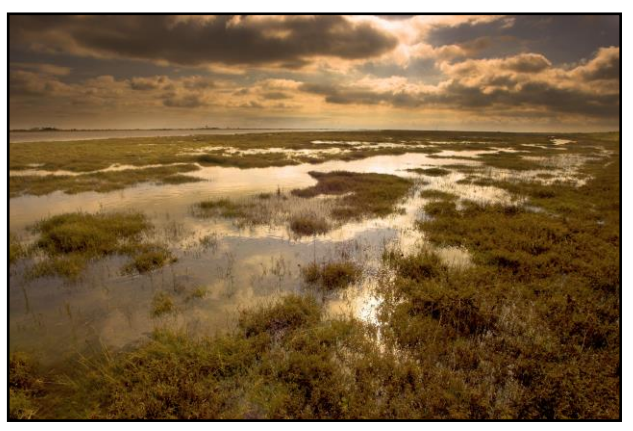
Restored saltmarsh at Wallasea Island.

At present, 20 million tonnes of silt and mud a year dredged from the UK's ports, harbours and marinas is disposed of offshore, but trials are under way in using this earth to restore saltmarshes. UKCEH is involved in a <u>pilot project</u> led by engineering firm Land & Water at Chichester Harbour.