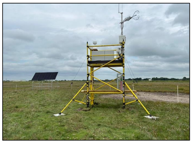
Measurements from UKCEH's flux towers will help establish the greenhouse gas removal potential of saltmarshes

It will enable saltmarsh carbon credits to be bought by private investors, thus providing an income stream for restoration.