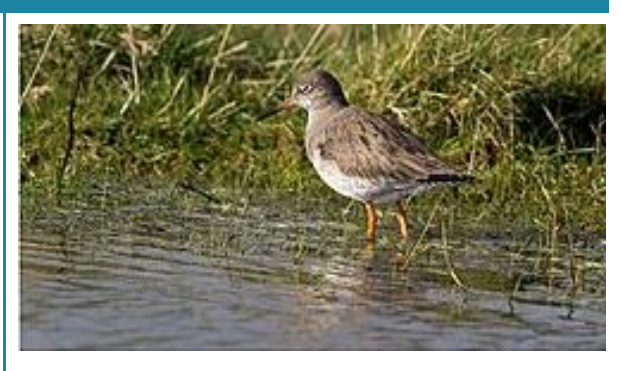
The degradation and loss of saltmarshes has reduced available habitat for these species at a time of an overall global decline in biodiversity.

Saltmarshes provide high-tide roost sites for tens of thousands of wading birds. They are also important habitats for seabass and other commercially important fish, and rare plants such as sea lavender and sea barley.