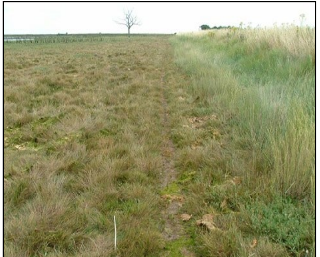
The restored saltmarsh at Tollesbury

Restoration is usually carried out by government agencies and conservation charities, informed by scientists, although mechanisms for private investment in restoration are also being developed.