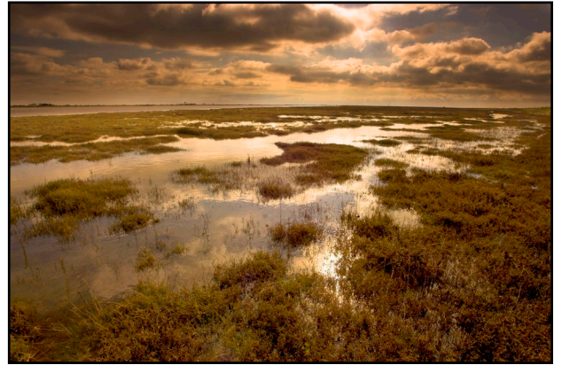
Restored saltmarsh at Wallasea Island.

At present, 20 million tonnes of silt and mud a year dredged from the UK's ports, harbours and marinas is disposed of offshore, but trials are under way in using this earth to restore saltmarshes. UKCEH is involved in a pilot project led by engineering firm Land & Water at Chichester Harbour.