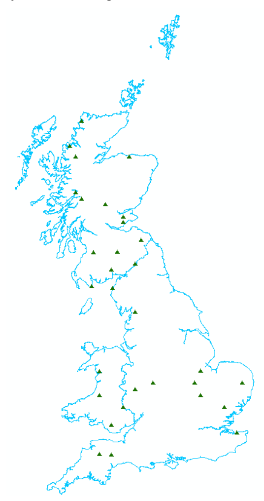
Fig. 1 Location of the freshwater quality assurance squares

In all 31 squares a stream was re-sampled, while 18 of the 31 squares contained a pond, which was re-surveyed. This represents an 8% re-survey effort for the stream tasks and a 7% re-survey effort for the pond tasks.