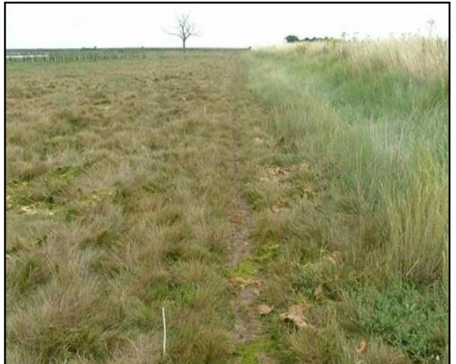
The restored saltmarsh at Tollesbury

Restoration is usually carried out by government agencies and conservation charities, informed by scientists, although mechanisms for private investment in restoration are also being developed.