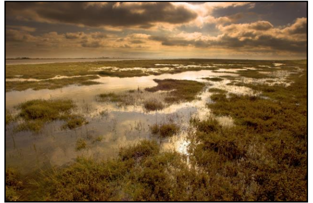
Restored saltmarsh at Wallasea Island.

At present, 20 million tonnes of silt and mud a year dredged from the UK's ports, harbours and marinas is disposed of offshore, but trials are under way in using this earth to restore saltmarshes. UKCEH is involved in a pilot project led by engineering firm Land & Water at Chichester Harbour.