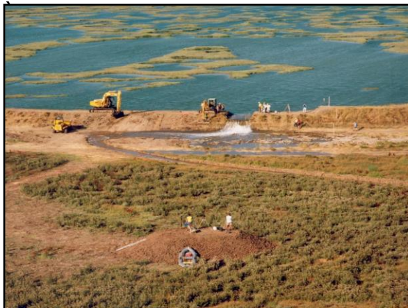
The sea wall at Tollesbury, Essex, was breached in 1995 to enable saltmarsh restoration.

It is the largest manmade coastal nature reserve in Europe.