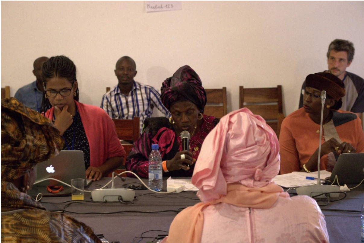
Photo: Parliamentarians and researchers at AMMA-2050 meeting June 2019 discussing the key results from AMMA-2050 research.