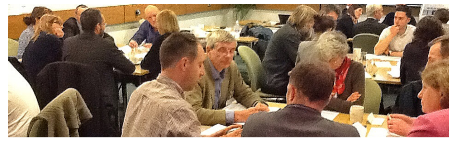
SIP researchers and stakeholders discuss the characteristics of a successful collaborative approach

Throughout the lifecycle of SIP a series of research workshops are being convened to discuss, elaborate and engage with the concepts and methods shaping platform activities. In early 2015 a workshop exploring the characteristics of landscape scale collaboration for sustainable intensification was held by platform researchers and stakeholders to inform platform activities taking place in the SIP case study areas. Participants learnt about findings of an academic review of research into farmer collaboration and considered the problems and prospects of collaboration in practice through series of recent and current case studies. This included reflections by project partners - the Allerton Project and LEAF - as well as a wider experiment in landscape scale approaches from the Marlborough Downs Nature Improvement Area. The policy and practice context of this way of thinking about sustainable intensification was provided by Natural England and Defra. These presentations became the focus of group discussion on the day in which some of the main characteristics of a collaborative, landscape scale approach were discussed and expanded upon. The findings of the day are being used by project researchers to shape early thinking about the collaborative measures that may be put in place on the ground.