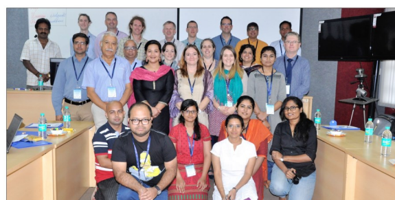
UPSCAPE Upscaling Catchment Processes for Sustainable Water Management in Peninsular India Project Launch Meeting, IISc Bangalore, 24-28 October 2016

India and UK UPSCAPE researchers met at IISc, Bangalore in October 2016. Our discussions formally brought together team members to share existing knowledge and research and feedback progress within the UPSCAPE project.