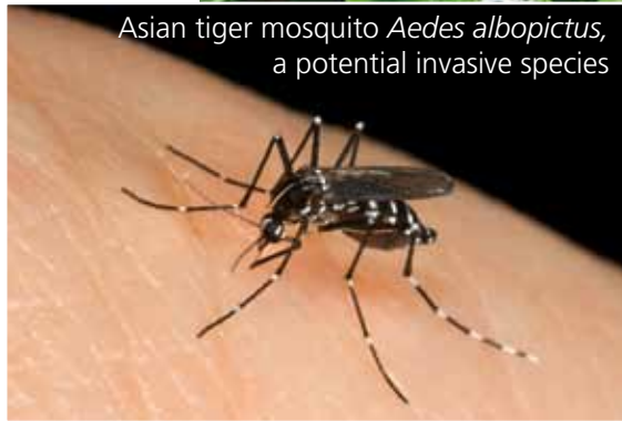
Asian tiger mosquito Aedes albopictus , a potential invasive species

An area of concern amongst scientists is how the changing climate will affect the range expansion of disease-carrying species such as mosquitoes and biting midges. Although the UK is currently at relatively low risk of mosquito-borne diseases, new research coordinated by CEH will provide vital baseline data to understand the current distribution of mosquitoes and biting midges, which can then be compared to data gathered in the future to understand change. By developing a nationwide infrastructure to monitor these insects and models to predict future trends, CEH science will help the Government and health agencies to prevent outbreaks of disease.